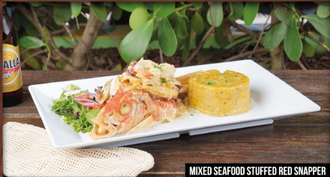
MIXED SEAFOOD STUFFED RED SNAPPER