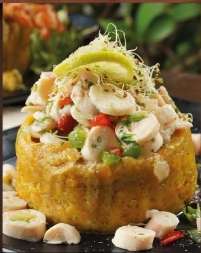
OCTOPUS STUFFED MOFONGO

Upgrade your mofongo to bifongo for $2 extra. / Cambia tu mofongo a bifongo por $2 extra.