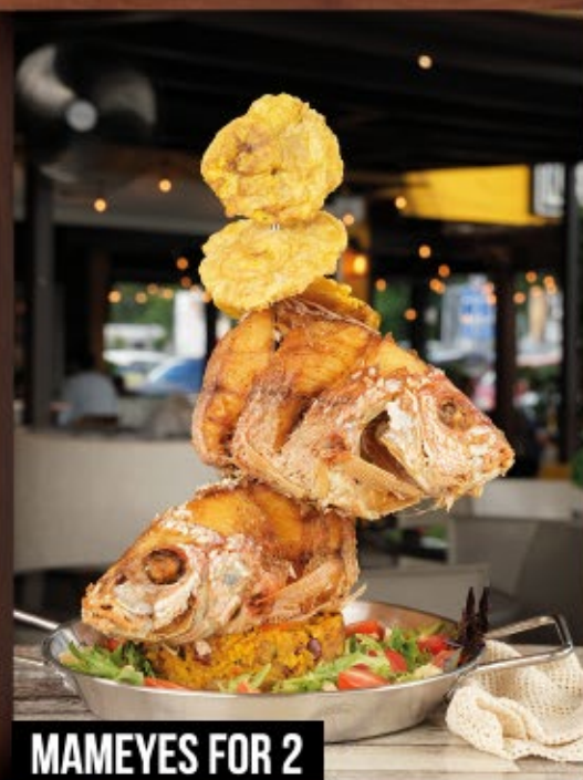
MAMEYES FOR 2